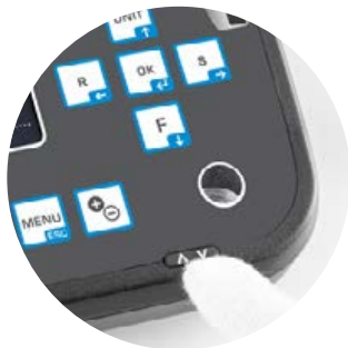
Opening possible alternatively via button