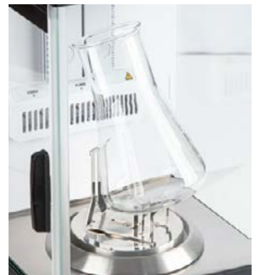
Erlenmeyer piston holder, included as standard with ABP 200-5M and ABP 200-5AM