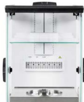
Internal draft shield - minimises the effect of air currents in the weighing chamber, only for 0.01 mg models of the ABP-A series