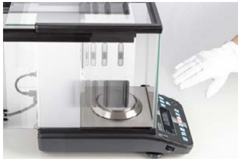
Automatic sliding doors, which can be opened and closed using sensors