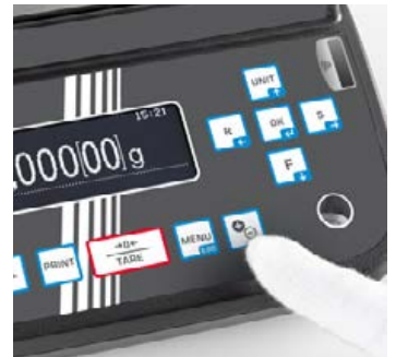
Ioniser (included) can be activated at the touch of a button