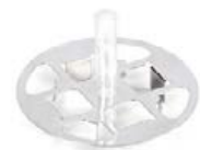
Multi-function weighing plate included with delivery for models with [d] = 0,01 mg