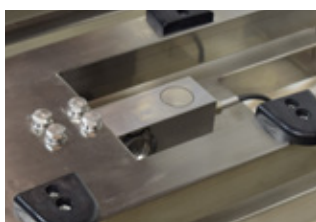
Load cell in stainless steel IP68